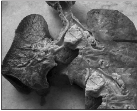
Figure 1 Sessile polypoidal friable carinal tumour with tumorous occlusion of both the main bronchi. Note collapsed left lung and hyperinflated right lung. Inset: smooth right bronchial mucosa after scooping out the tumour fragment.

was sudden respiratory distress and the child died.