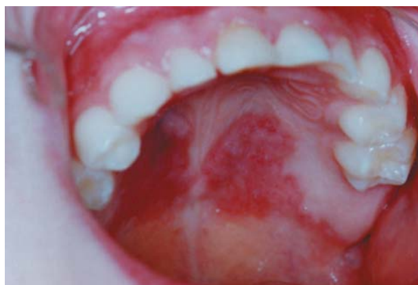
Figure 1 The unusual, butterfly shaped, pigmented, indolent palatal lesion that was present for many years in our patient.

J Clin Pathol 2005;58:1339-1341. doi: 10.1136/jcp.2004.025098