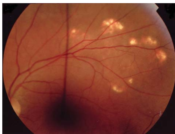
Figure 1 Colour fundus photographs of the left eye showing multiple yellow white lesions in the superotemporal retina. The right eye had a similar appearance. The linear artefact is secondary to focusing rod.

Blood results revealed hypokalaemia (3.1 mmol/litre; normal range, 3.5–5.0), hypomagnesaemia (0.30 mmol/litre; normal range, 0.7–1.0), and raised globulin (39 g/litre; normal range, 18–35). Serum electrolytes—sodium, chloride, calcium, and phosphate—were normal, as was her parathyroid hormone value. A 24 hour urine analysis showed hyperkalaemia (102 mmol/24 hours; normal range, 25–100), hypocalciuria (1.6 mmol/24 hours; normal range, 2.5–7.5), natriuresis (227 mmol/24 hours; normal range, 50–200), and