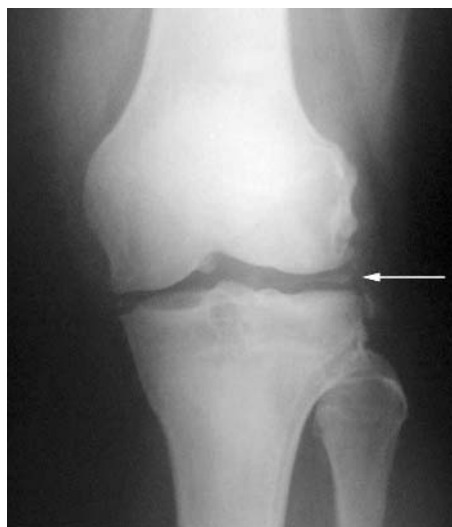
Figure 3 Plain x ray showing calcium pyrophosphate deposition in the fibrocartilage of the left knee (white arrow).