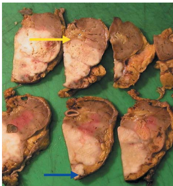
Figure 4 The use of digital photography retains a record of the dissection and the identification of areas of tumour invasion of the renal sinus (yellow arrow) or extracapsular spread (blue arrow). The digital image can be reviewed as part of multidisciplinary team meetings.