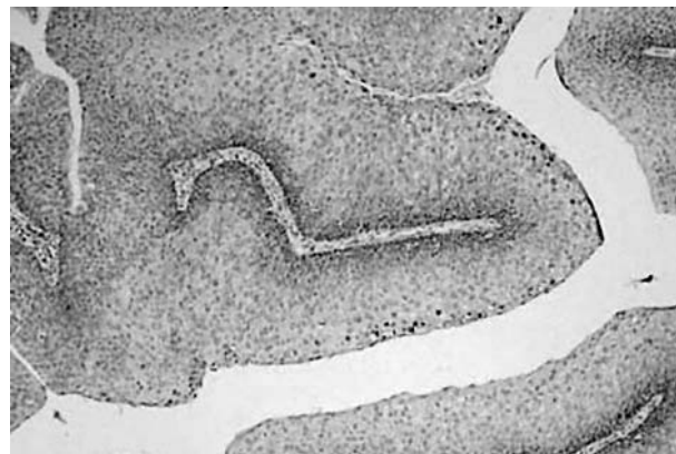
Figure 2 Positive DNA in situ hybridisation for human papillomavirus 6/11 in the endophytic component of oral inverted ductal papilloma (case 5).

Of the six cases of oral IDP identified from archival material, there was an equal sex distribution, with three cases