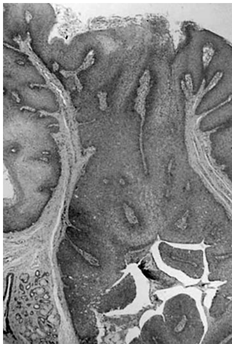
Figure 3 Haematoxylin and eosin stained section showing the classic histological features of oral inverted ductal papilloma.

They present clinically as small, isolated, well defined nodules, which do not recur after conservative local excision. 11 Our study identified light microscopic features of HPV infection in five of the six cases studied and detected HPV 6/11 DNA in three of them. This is the first report documenting the presence of HPV DNA in oral IDP. To date, in only two case reports of oral IDP were the samples tested for HPV DNA. One study used ISH as a detection method for HPV DNA, whereas the other used PCR. Both cases were found to be negative. 8 10