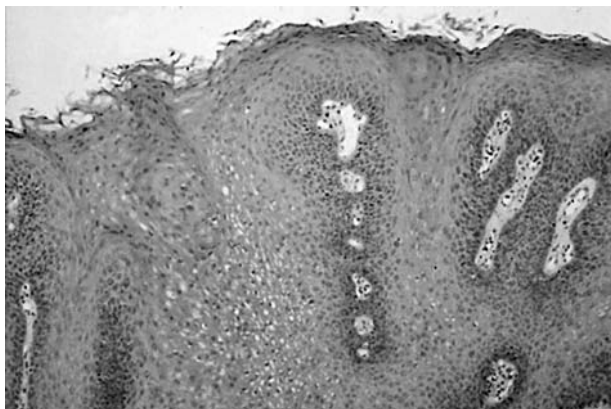
Figure 4 Histological features of human papillomavirus infection, including hyperkeratosis, papillomatosis, and koilocytosis seen in the surface component of this oral inverted papilloma.

Although there is a histological similarity between oral IDP and sinonasal inverted papilloma, the clinical presentation and prognosis are considerably different. Histological features common to both tumours include an endophytic proliferation of broad papillary projections composed of stratified squamous epithelium containing microcysts and mucous cells. Although sinonasal inverted papillomas are predominantly endophytic, they may present with an