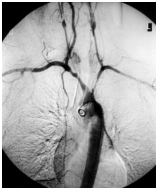
Figure 2 Arch aortogram demonstrating severe involvement of all extracranial vessels; the descending thoracic aorta appears to be normal.

enable diagnosis, but tuberculosis has remained an important differential and possible aetiological factor. However, tuberculous aortitis tends to cause erosion of the vessel wall with the formation of true or false aneurysms, particularly affecting the descending thoracic and abdominal aorta. Dissection and rupture are important complications rather than the stenoses typical of Takayasu arteritis. The incidence of rupture and bleeding complications of aneurysmal Takayasu arteritis is low. Syphilis tends to affect an older age group, with calcification, sparing the descending thoracic aorta, and stenoses are not a feature. 9 Hypertension as a result of fibromuscular dysplasia is an important differential diagnosis.