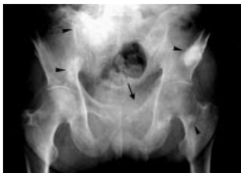
Figure 1 Anteroposterior radiograph of the pelvis in a 72 year old atomic bomb survivor shows the multiple sclerotic foci of haemangiomas (arrowheads) and an extensive osteolytic lesion in the left pubic bone (arrow). Biopsy specimens obtained from the pubic bone revealed a high grade angiosarcoma.

Accepted for publication 16 February 2001