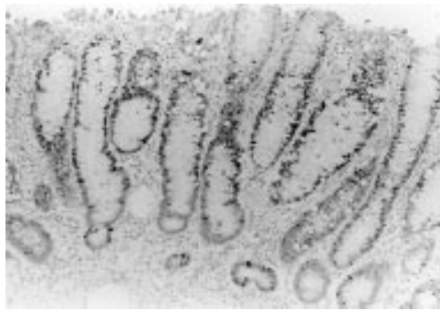
Figure 1 Immunohistochemical expression of p53 in low grade dysplasia (tumour number 2 in patient number 1 of the ulcerative colitis of long duration with neoplasm group). Diffuse aggregation of positive cells categorised as (++) was seen.

DNA was amplified by the polymerase chain reaction (PCR) as described previously. Six microsatellite markers (D2S123, D3S1611, D3S1029, TP53, Mfd26, and BAT26) were