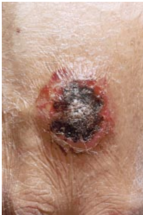
Figure 1 Initial lesion on dorsum of right hand, which developed an ecthyma gangrenosum appearance.