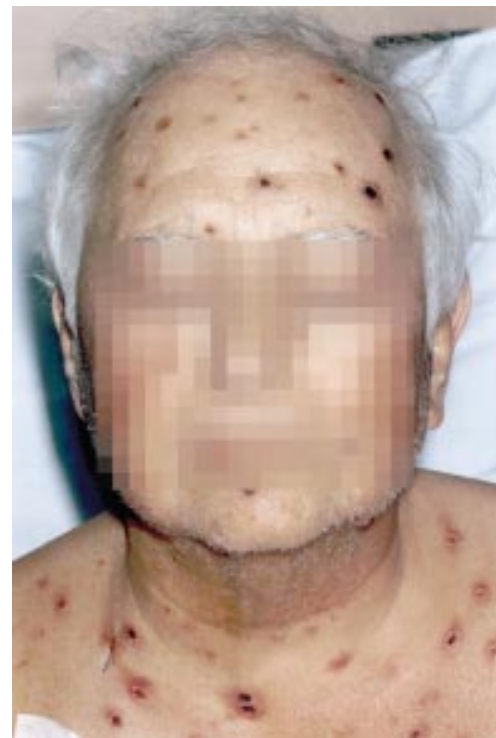
Figure 2 Multiple skin lesions on patient's face and thorax. Initially, many had a vesicular appearance and later developed central necrosis.