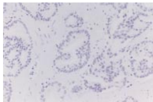
Figure 4 Absence of cyokeratin 8 expression in histomorphologically unaffected malignant epithelium within the high intensity focused ultrasound lesion. CAM5.2 antibody.

diaphragm in three cases. The proximal part of the seminal vesicles was affected unilaterally in three patients and bilaterally in two. In four patients, a 1–2 mm broad subcapsular rim of histologically unaffected prostate tissue was preserved at the dorsal side of the HIFU lesion, indicating incomplete tissue destruction. In all patients, unaffected tissue was also found at the ventral and lateral side of the HIFU lesions.