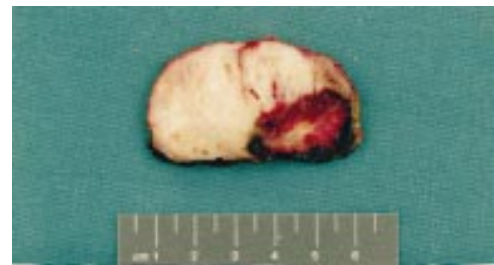
Figure 1 Prostate slice showing a high intensity focused ultrasound (HIFU) lesion. The HIFU lesion is characterised by a central yellow/white, necrotic zone surrounded by an outer dark red, haemorrhagic zone. The distance between two cross bars represents 0.5 cm.

After fixation and slicing of the specimens, circular to elliptical lesions were identified at the