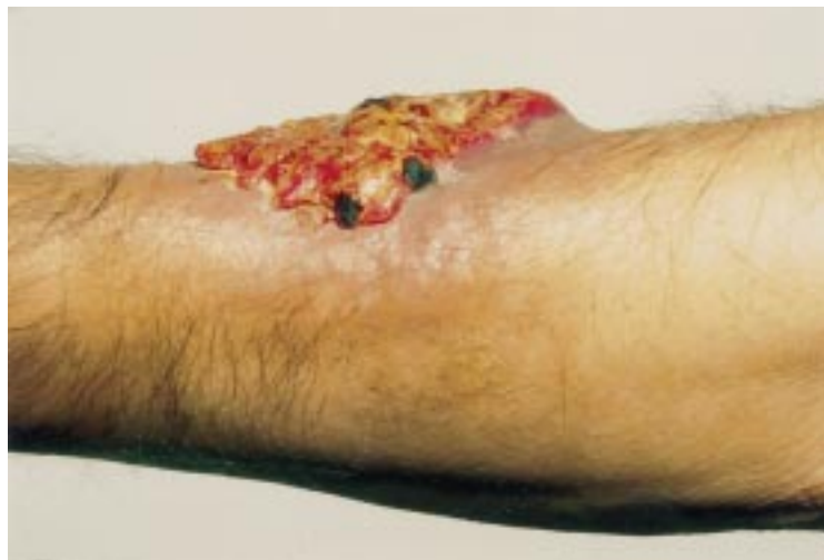
Figure 1 Lesion on the forearm at the site of intravenous cannulation.